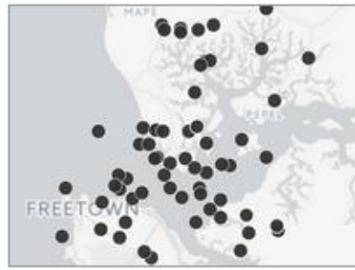
View all events